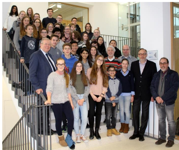
First Aid course – Diploma award ceremony 2017

During the first term of each school year, students have the opportunity to participate in a basic First Aid training course. This First Aid course is held in Luxembourgish or English by instructors from the Red Cross.