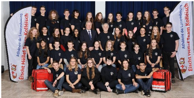
D'Team in January 2017